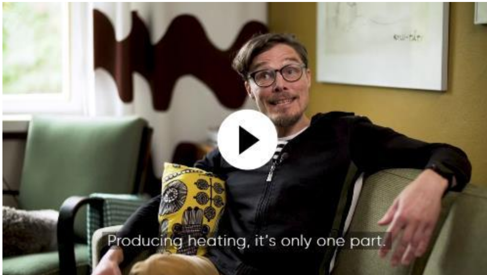
BBCStoryWorks - Helsinki's Energy Renaissance