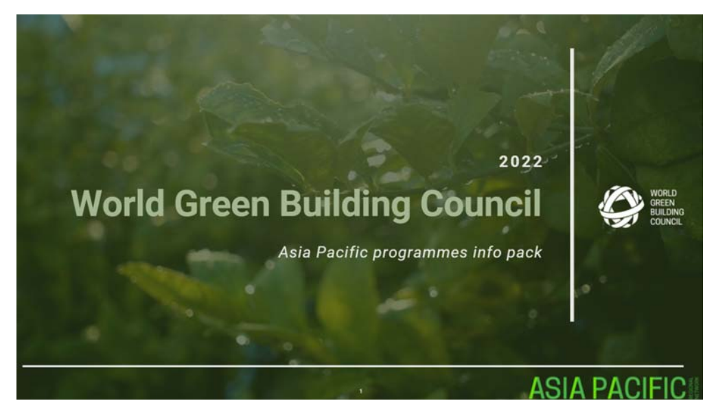
Asia Pacific Network Festival 2022

Save the date for the <u>The Asia Pacific 20.22 Festival</u>, which coincides with WorldGBC's 20th Anniversary. With a host of events from June — November 2022 , and a different theme focussing on sustainability each month, this will be a pivotal event in our Asia Pacific Regional Network to collaborate, innovate and learn.