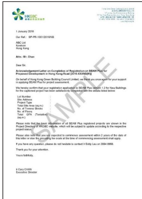
Fig. 2: Sample of Acknowledgement Letter

After completing the project registration, the basic information of the project will be shown in the Project Directory of HKGBC website, which will be subject to update according to the respective project status.